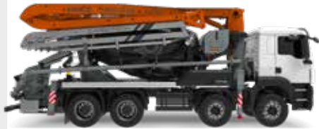
Placing boom MK28H